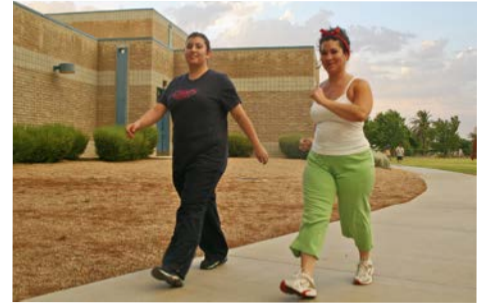
Walkers on the El Reposo Park loop in South Phoenix – one of the first phase WalkPHX sites

The first WalkPHX phase includes the following parks: Cholla Cove, Cielito, Dynamite, El Reposo, Los Olivos, Manzanita, Maryvale and Paseo Highlands. Steele Indian School